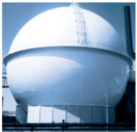
Fast breeder-reactor at a power plant at Dounray, Scotland.

Adding yet more pressure to encourage new nuclear power is the issue of security of supply. Again, it is hard to argue with the government's rationale that the nuclear option would increase diversity in the fuel mix and thus increase security of supply.