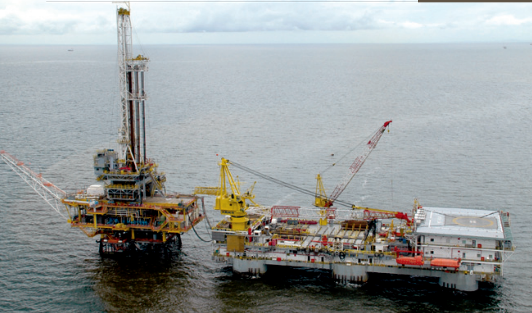
Unmanned smart field platform at Champion West, Brunei.

and operators with real-time data about well conditions and the options for opening and closing well sections - with enhanced information and communication technology.