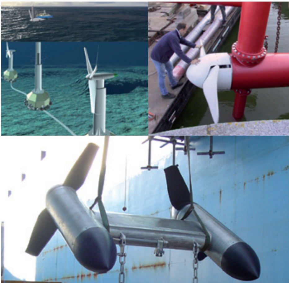
Top left: Swanturbine. Illustration: OpenHydro Group. Top right: Torcardo's turbine design. Bottom: Tidal design of SND.

However, any barraging of the Severn estuary is highly controversial. The area is a wetland of international importance, and the Royal Society for the Protection of Birds (an organization with over a million members) claims that over 85,000 migrating and wintering water birds and waders will lose their feeding grounds, if STPG's plan goes ahead. The lobby