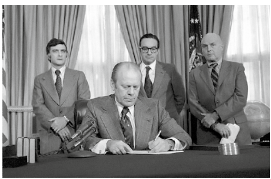
President Ford signs the proclamation that imposes higher tariffs on imported oil in January 1975. Alan Greenspan (centre) is watching.

on the desire to move the country away from dependence on fossil fuels towards a new sustainable and environmentally friendlier system. The plan has very ambitious targets for raising energy efficiency, reducing \mathrm{CO}_2 emissions though cap-and-trade, beginning a transformation away from the internal combustion engine and stimulating massive penetration of renewable energy sources.