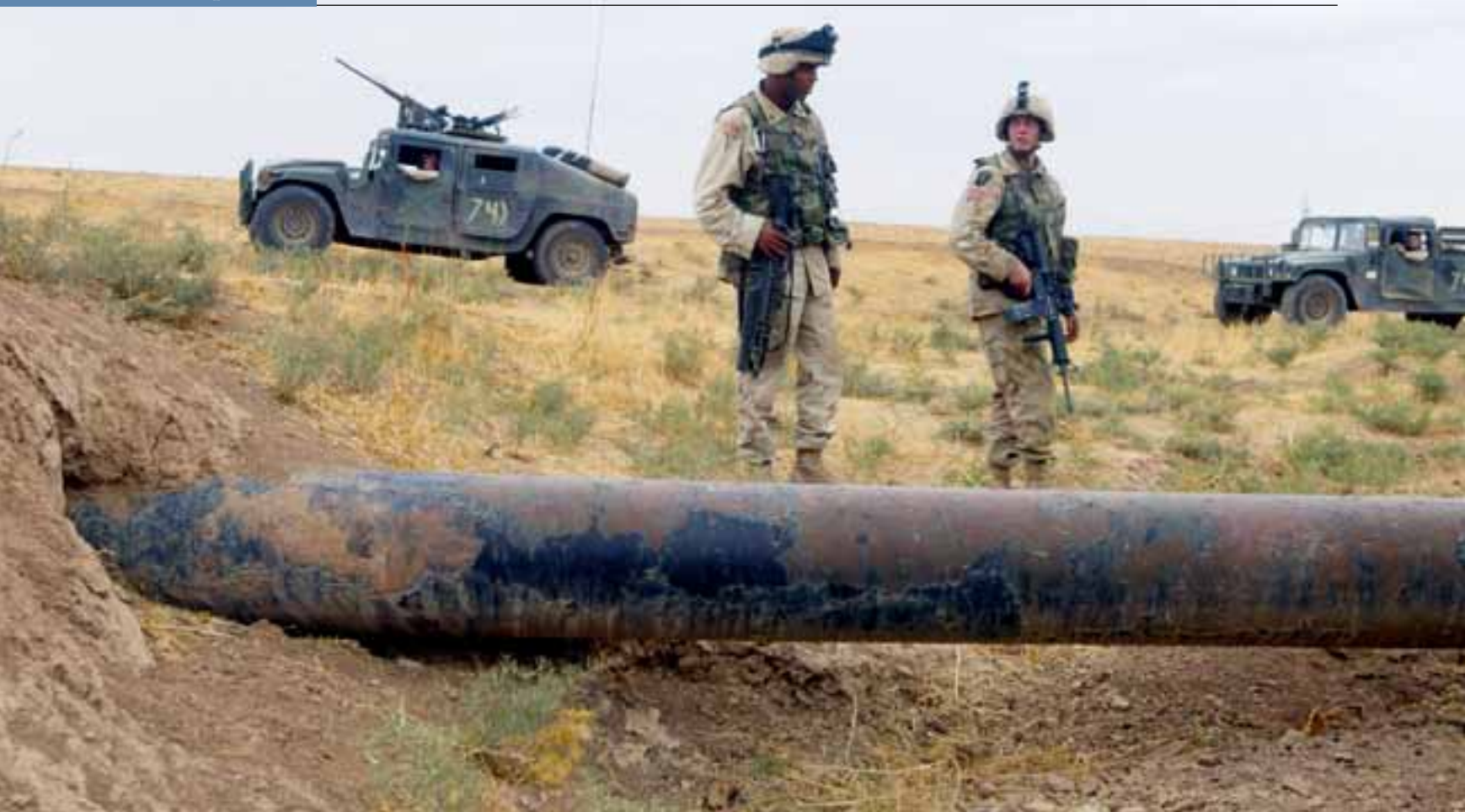
Two soldiers walk along an oil pipeline in Iraq.