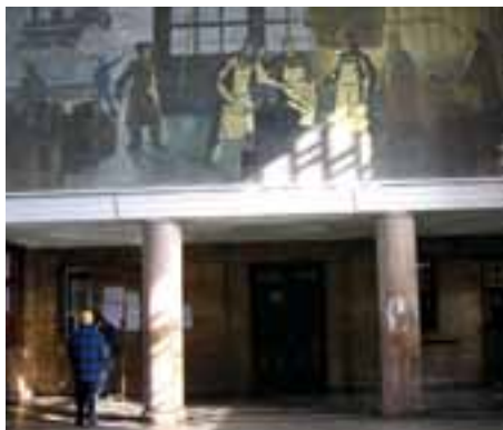
Hunedoara train station.