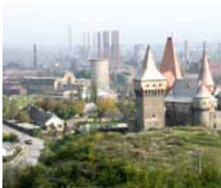
Hunedoara Castle.

Taken over in 1998 by the Greek company Mytilineos, the Sometra blast furnace employs 1010 workers, a fraction of the 5000-strong workforce it once had. Copsa Mica's mayor acknowledges he faces a dilemma: 'The smelter is our biggest source of income and at the same time our biggest problem.' Mihalache welcomes the Greek investment in the plant, but his biggest challenge remains the improvement of his city's environmental conditions and