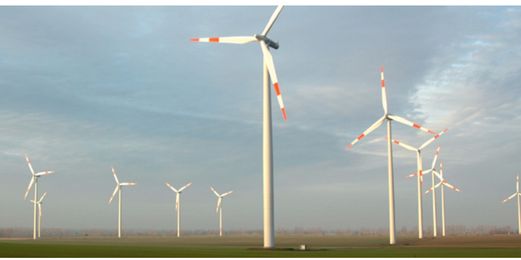
Wind turbines near Berlin.

may very well achieve: improved transborder cooperation and regulation, the creation of a functioning European grid and, despite the companies' denials, improved security of supply. The experts also warn, however, that for all of these positives, OU is just the first step of many that have to be taken.